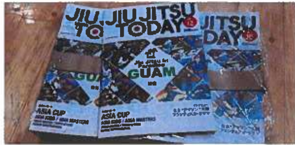
Guam's premier Brazilian jiu-jitsu tournament Mariana's Open has been featured in the latest issue of Jiu-Jitsu Today, one of Japan's most respected and widely circulated martial arts publications.

With approximately 40,000 copies distributed across Japan, India, Thailand, Hong Kong, the