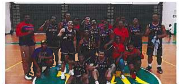
The Fall 2026 Champions of Triton Men's Basketball League are the KFC Bombers.

Triton Men's Basketball All-League Team: